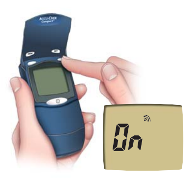
(See Notes on following page.)